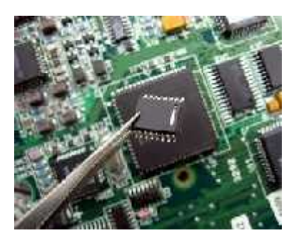
Figure 6: Semiconductor integrated circuits layout design logo

Semiconductor integrated circuits layout design: Semiconductor integrated circuits layout design registry works for protection of semiconductor IC layout designs. The provisions come under semiconductor integrated circuits layout design act, 2000.